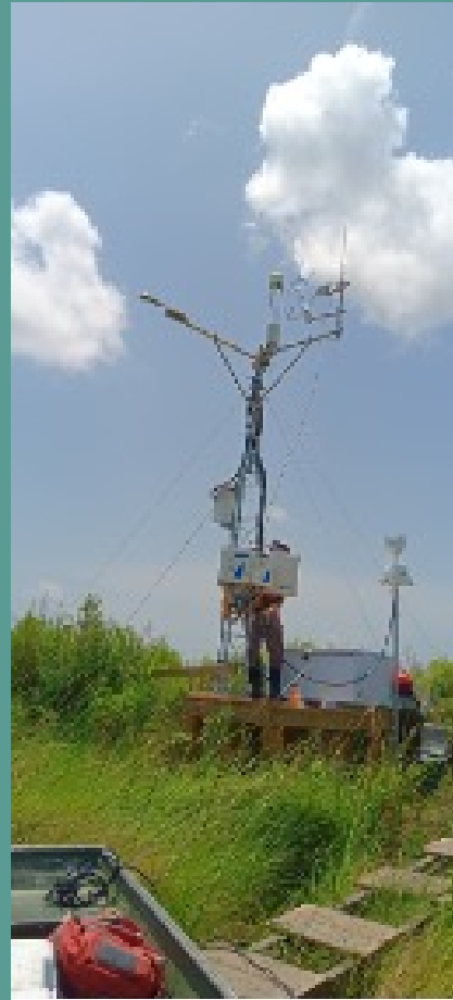
Continuous monitoring Ameriflux tower site.

The project complements and draws from on-going efforts and expertise of the Salt Bayou Watershed Workgroup's effort to restore coastal marsh health in Jefferson County, TX. In addition to the county, members include individuals from Texas Parks and Wildlife, US Fish and Wildlife, TAMU-G and Lamar University.