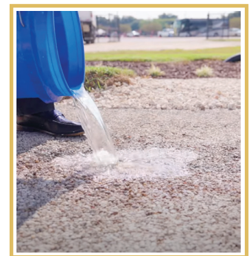
Testing water absorption into pervious concrete pavement.