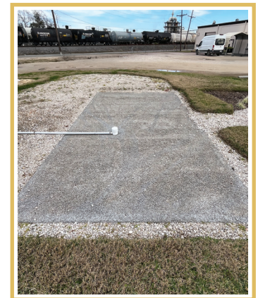
A pervious concrete pavement test site.