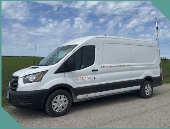
Mobile Sniffer Lab pictured during measurements.